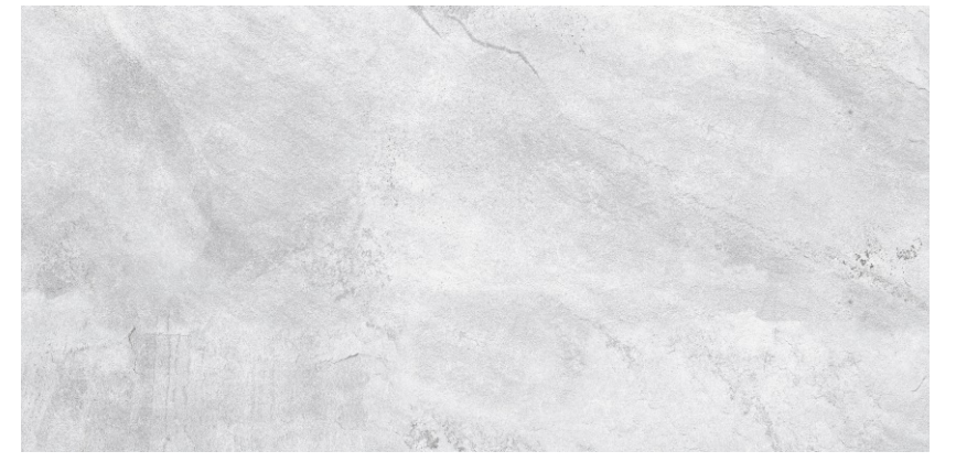
Dogma Project Antibacterial Urban Silver Matt 60 cm x 120 cm

DOGMA® presents a new range of hygienic products DOGMA PROJECT ANTIBACTERIAL. The application of new technical glazes capable to stop the reproduction of bacteria guarantees antimicrobial protection to surfaces, ensuring a healthy environment, free of dirt and odor. The new technology applied to our ceramic tiles is ideal for all locations, especially with bacterial growth, such as kitchens, bars, restaurants, hotels, doctor's offices, schools, public offices, baths, SPAs and swimming pools. Ideal for personal and commercial use. DOGMA PROJECT ANTIBACTERIAL achieves the progressive elimination of bacteria by blocking growth, interrupting their life cycle.